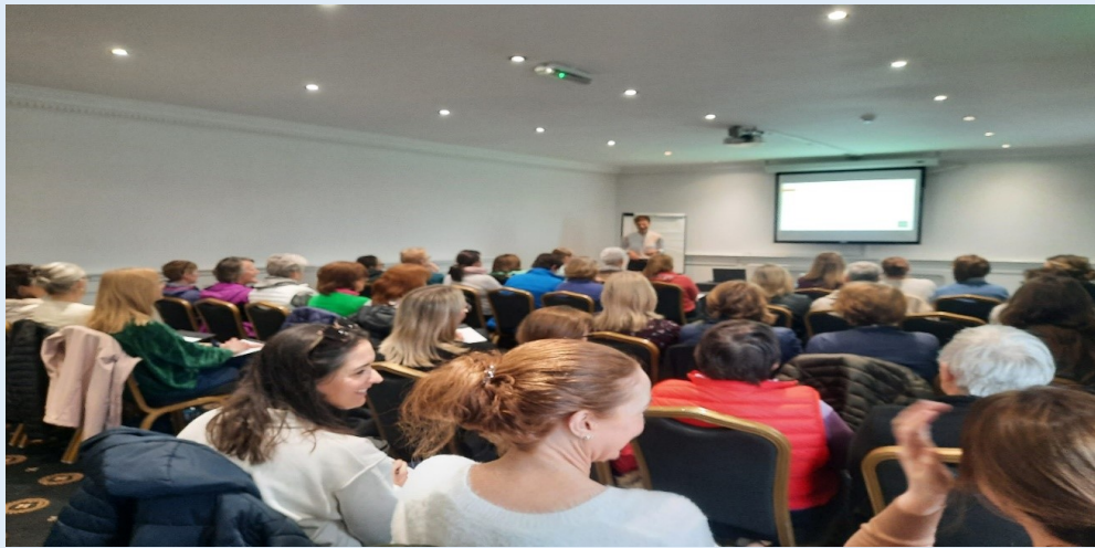
Figure 1 Participants enjoying workshop on How to Train as a Midlife Woman

A workshop on How to Train as a Midlife Woman in Nenagh. This workshop provided participants with practical solutions and science based strategies for active women and to help those who wish to continue to perform as you age.