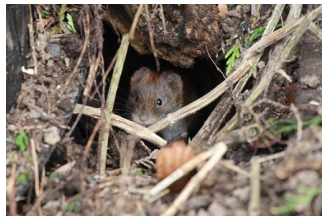
Bank Vole

If you would like to be part of our mailing list please send an email with "Subscribe" in the subject line to: heritage@tipperarycoco.ie Follow us on Facebook and Instagram: Tipperary Heritage Office.