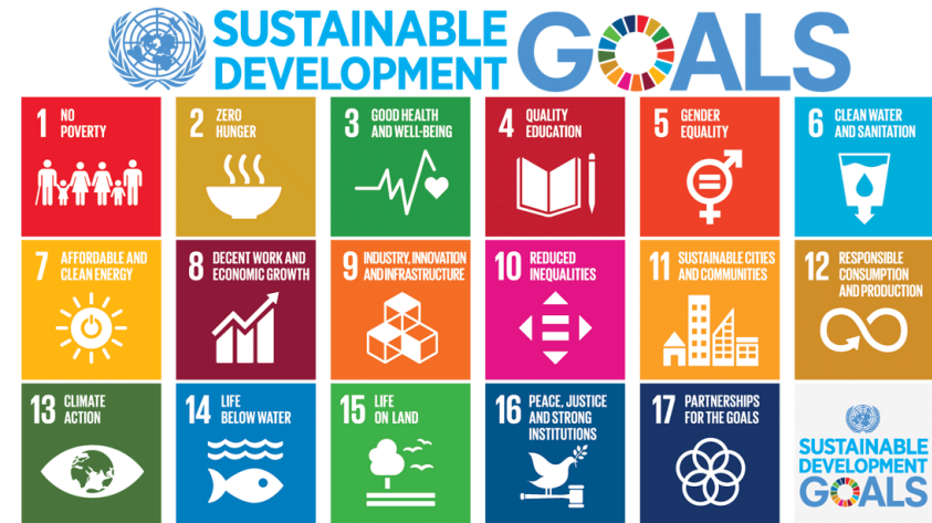
Figure 3: UN Sustainable development Goals