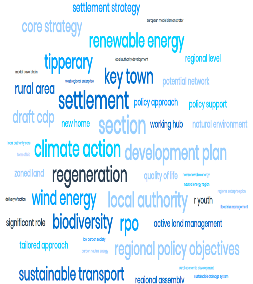
Figure 5: Illustration of reoccurring themes arising