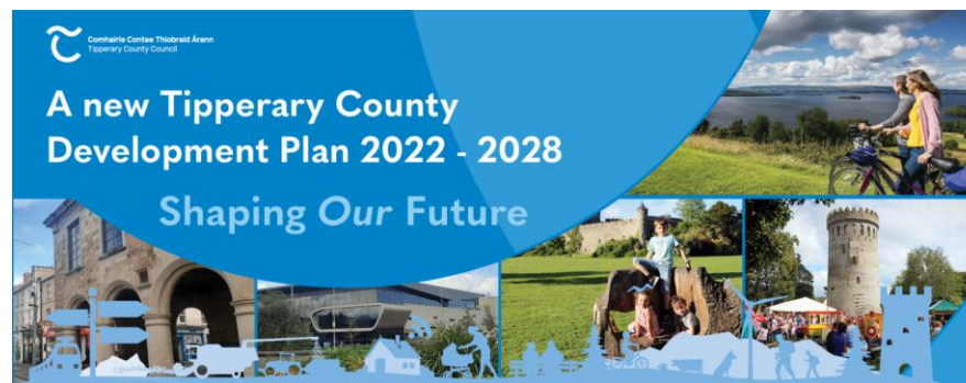
Figure 2: Example of branding for the plan-making process.