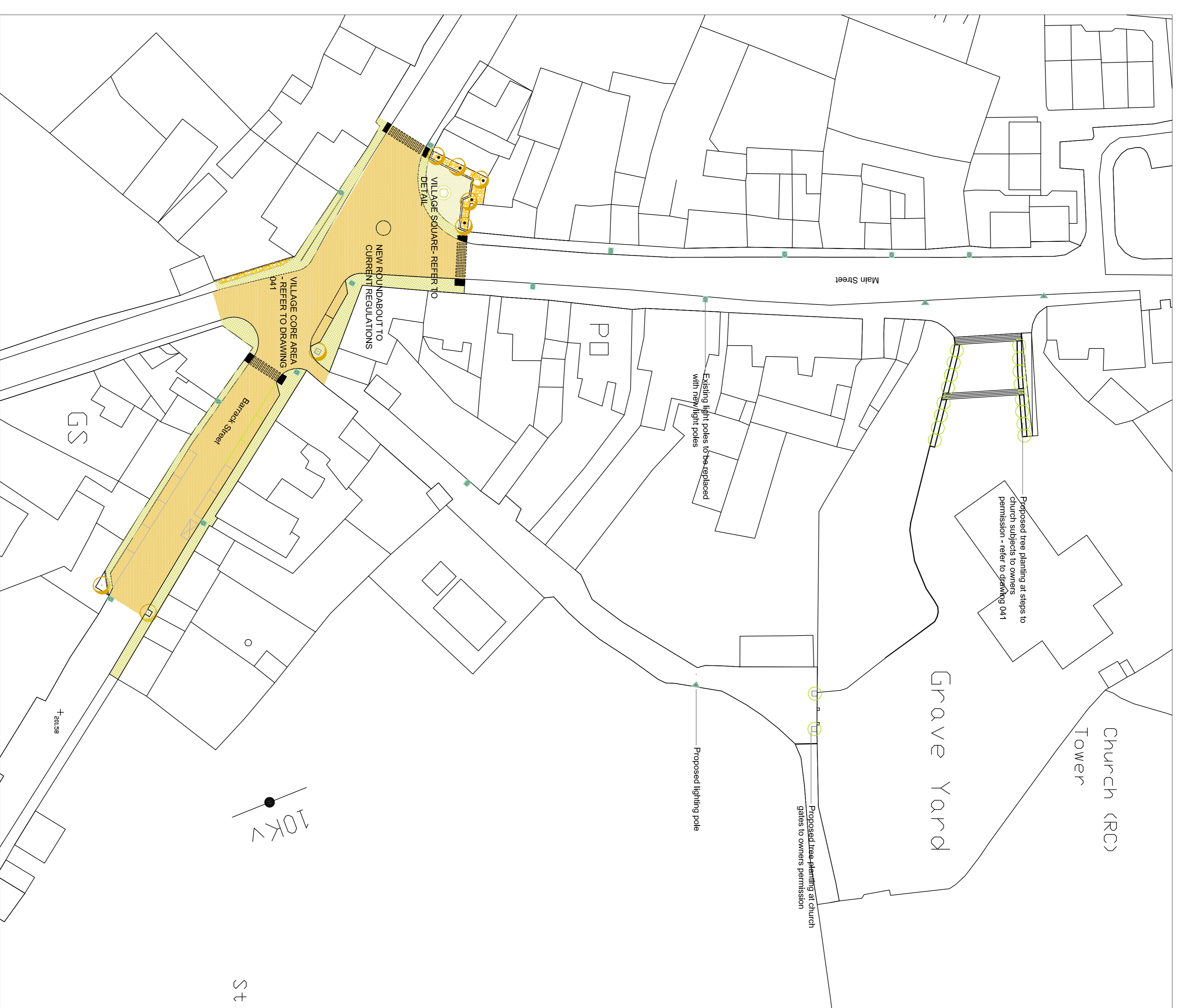
3 CENTRAL VILLAGE SQUARE & MAIN STREET SCALE 1:1500